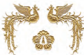
The President of the Republic of Korea