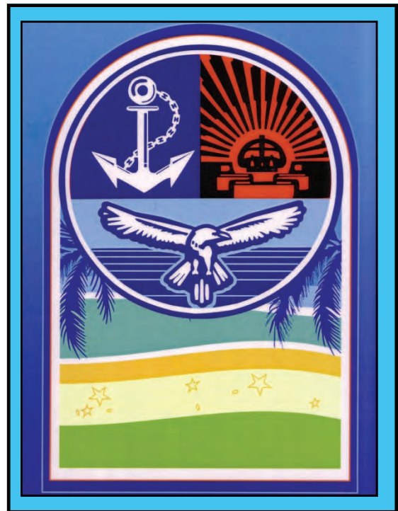
Tweed Heads & Coolangatta Sub-Branch